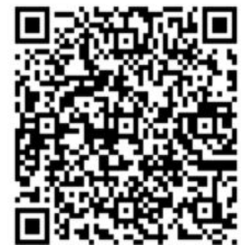
Convention QR Code

"In the same way, your light must shine so that it can be seen by others; this will enable them to observe your good works and give praise to your Father in heaven." Matthew 5:16"